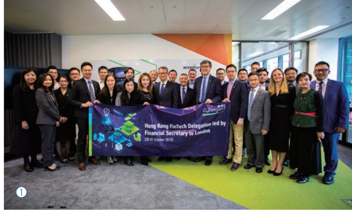
① Cyberport FinTech delegation led by the Financial Secretary to London 数码港参与由财政司司长率领的金融科技代表团访问伦敦 ② Digital Entertainment Leadership Forum (DELFF) at the new esports venue located at Arcade@Cyberport “数码娱乐领袖论坛”于数码港商场的全新电竞场地举办 ③ Cyberport community start-ups scoop 19 awards at Hong Kong ICT Awards 2019 数码港社群于“2019 香港资讯及通讯科技奖”勇夺 19 奖项

数码港金融科技潜力正不断增长。去年埃森哲亚太区金融科技创新实验室入围的八家初创企业当中，数码港初创企业占三家，分别是Mellow、医结和Interlinkages。在2019年经济通“金融科技大奖”中，19家数码港金融科技公司囊括了九个组别中20个奖项，其中Quantifeed更勇夺“2019金融科技大奖”及“2019金融科技大奖—财富投资与管理：杰出人工智能商用投资应用平台”殊荣。