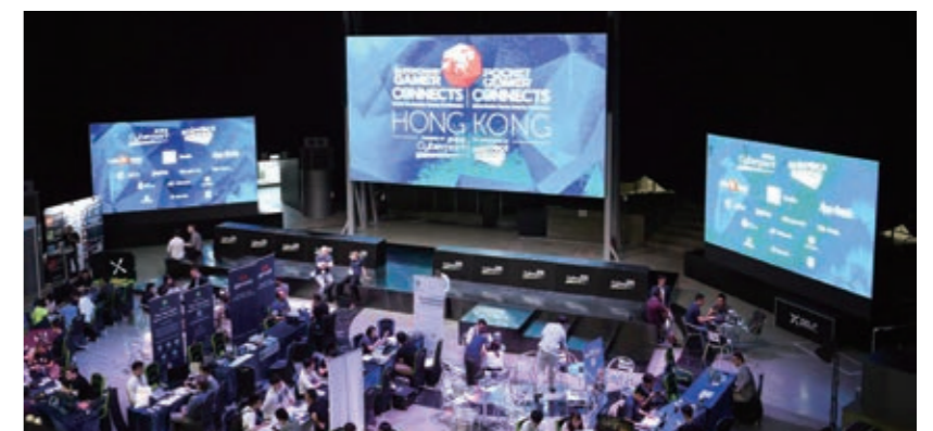
Blockchain Gamer Connects, a leading international mobile gaming industry event held in Asia for the first time, fully powered by Cyberport 国际游戏界盛事“Blockchain Gamer Connects”首次在亚洲举行，由数码港全力策划