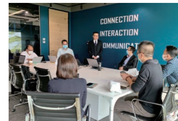
The Cyberport Enterprise Network arranged a total of 44 business matching sessions this year “数码港企业网络”今年合共安排了44场商业配对环节

Public services is another sector inviting digital transformation. During the year, the Office of the Government Chief Information Officer (OGCIO), Cyberport, and the Hong Kong Science and Technology Parks Corporation (HKSTP), jointly organised three Technology Forums to help start-ups and SMEs better understand the operational needs of government departments. The sessions spotlighted smart city infrastructure, blockchain technology for public services, and intelligent transport system and traffic management. Start-ups from both Cyberport and HKSTP presented their solutions to government representatives.