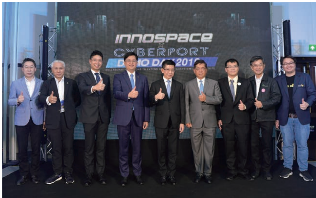
Cyberport start-ups pitched to Thailand and ASEAN corporations and investors on The Innospace Cyberport Demo Day in Innospace Cyberport Demo Day 2019. 数码港初创企业向泰国和东盟的公司及投资者演示其方案。

As we move forward, Cyberport's international networks will play a crucial role in helping start-ups gain exposure to potential investors and expansion opportunities all over the world. We look forward to engaging more technology enterprises and overseas talent to join the Cyberport community, further invigorating the local I&T ecosystem, and enhancing our competitiveness for the 'new normal'.