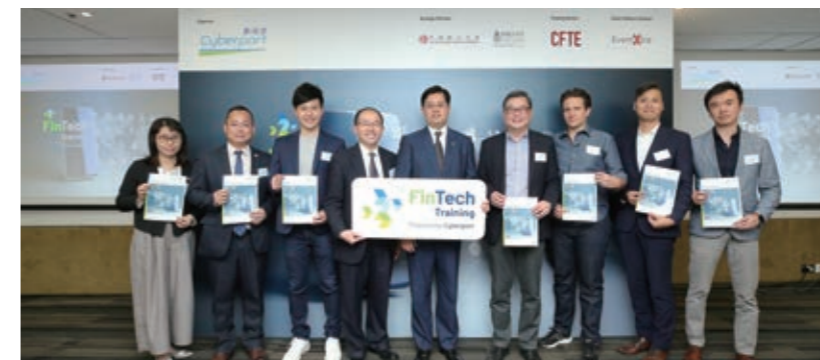
The Cyberport Financial Practitioners FinTech Training Programme was launched in March 数码港于三月推出“数码港金融从业员金融科技培训计划”

Accelerated digital transformation is spurring practitioners across industries to gain new skills and credentials, and the need for FinTech skills in the financial sector is especially pronounced. In response to the government's call for enhanced FinTech training for financial practitioners in last year's Policy Address, Cyberport was entrusted by the Financial Services and the Treasury Bureau to debut the Cyberport Financial Practitioners FinTech Training Programme in March 2020. The programme, which features a series of seminars and workshops over a year, enriches Hong Kong's FinTech talent pool, promotes FinTech adoption by financial institutions, speeds up digital transformation, and fortifies our competitiveness as an international financial centre. Nearly 2,000 practitioners are expected to benefit from the programme, and they will receive a government subsidy of 80 per cent of the training fee.