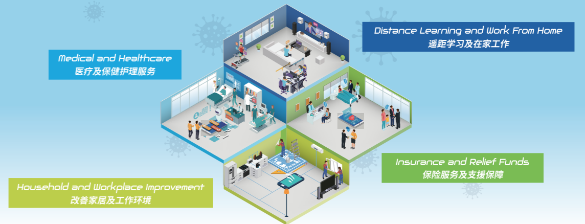
Cyberport kickstarted the Braving the Epidemic campaign in February this year 数码港在今年二月开展“敢创抗疫”行动

2019/20年度，初创企业及科技公司均受到中美贸易紧张局势以及疫情对经营造成的打击所影响。早期初创企业需面对现金流紧缩和销售额回落等挑战；而成熟的初创公司则要衡量市场变化而重整发展策略。为协助社群成员应对当前的困难，数码港实施了多项措施，以协助数码港社群成员纾缓经营压力，保持竞争优势。