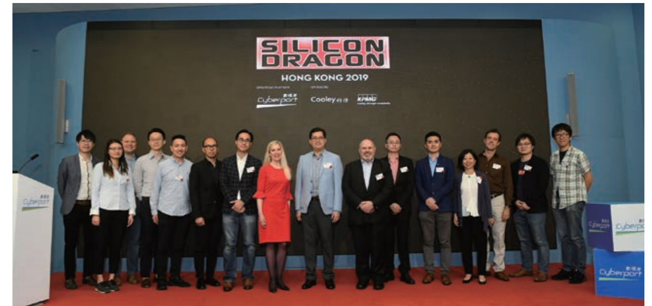
Start-ups exchanged ideas with successful entrepreneurs, venture capitalists and industry experts through participating in Silicon Dragon. 初创企业通过参与 Silicon Dragon, 与成功企业家、风险投资者及业界领袖交流。

继往开来, 数码港的国际网络将扮演重要角色, 协助初创企业与全球潜在投资者接触及开拓国际市场。展望未来, 我们期望能吸引更多科技企业和海外人才加入数码港社群, 进一步振兴本地创新科技生态系统发展, 提昇我们在新常态下的竞争力。