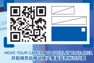
MOVE YOUR CAMERA TO OVERLAY BLUE AREA 开启网页后移动镜头覆盖蓝色标示位置