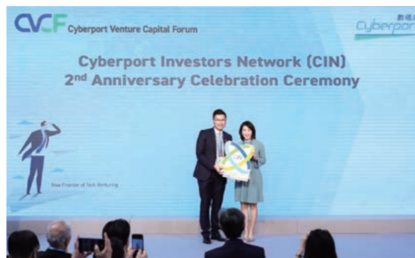
Cyberport Venture Capital Forum 2019 marked the second anniversary of the Cyberport Investors Network "2019数码港创业投资论坛"标志着“数码港投资者网络”成立两周年