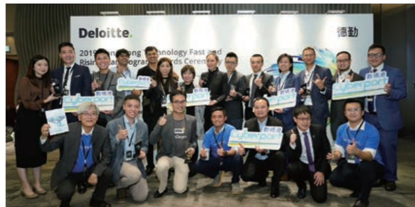
13 Cyberport start-ups awarded in Deloitte Hong Kong Tech Fast Program last year 13家数码港初创企业去年荣获德勤颁发“香港高科技高成长暨明日之星”殊荣

Cyberport also turned July into a Digital Entertainment Month to galvanise engagement further. Blockchain Gamer Connects, the acclaimed international conference that explores blockchain and games, made its Asian debut; In addition to this, we partnered with other industry stakeholders to present competitions and events. We organised the League of Legends International College Cup 2019, LoL Campus League 2019 Finals (Secondary & Tertiary Division), Blocky League eSports Competition Finals, and EMF 2019: LoL International College Championship Qualifiers.