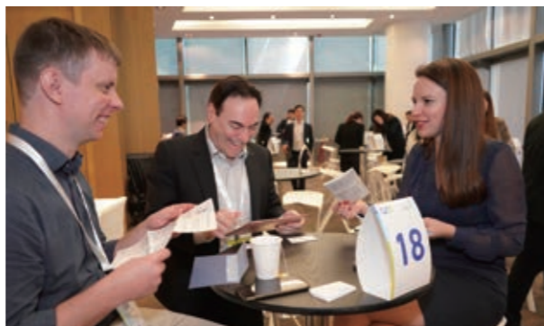
Cyberport actively expands its global network of partners and investors to support the development of start-ups 数码港积极拓展全球合作伙伴和投资者网络，以支援初创企业发展