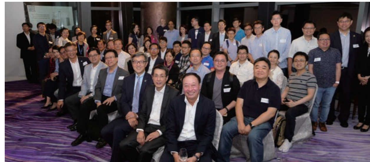
Community Connect Programme was launched to strengthen connection among Cyberport community members and explore industry collaboration 社群联系计划旨在加强数码港社群成员之间的联系，发掘新的协作机会

数码港初创企业也与机电工程署机电创科网上平台建立联系，平台整合政府不同部门的技术需求，与项目提案作出配对。平台载列数码港初创企业研发的十多个方案，政府部门更已采纳其中两个方案，分别是为机电工程署提供电动车充电设施的oneCHARGE，以及为机电工程署、惩教署、消防处和运输署提供体温检测机器人的路邦科技。