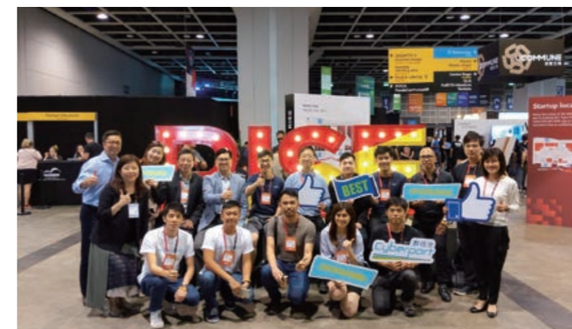
Cyberport participated in RISE Conference in July last year, introducing Cyberport start-ups to attendees around the world. 数码港在去年7月参与了 "RISE会议", 向世界各地的参加者介绍园区的初创企业。