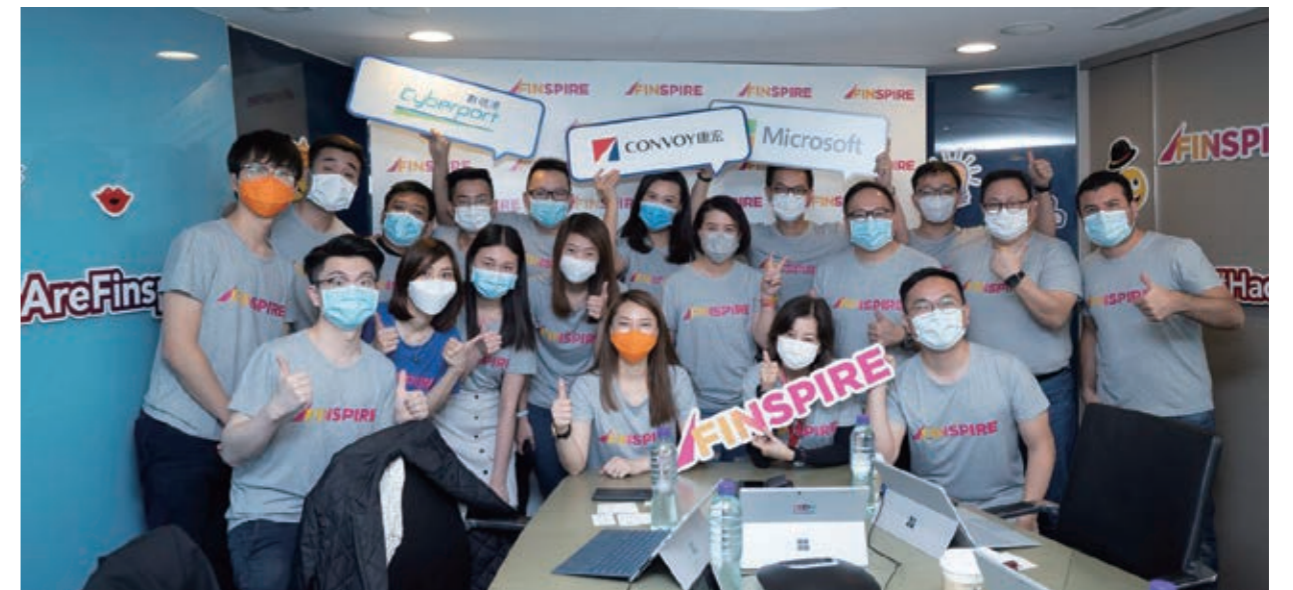
Cyberport and Convoy co-organised the FINSPIRE Hackathon to encourage university students to design innovative FinTech solutions. 数码港与康宏合办“FINSPIRE Hackathon”，鼓励大学生设计创新金融科技方案。

Leveraging digital technology will be a key in the post-epidemic new