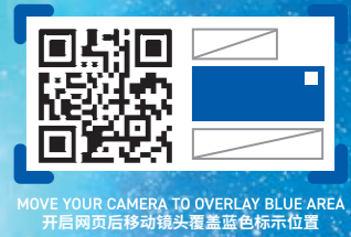
MOVE YOUR CAMERA TO OVERLAY BLUE AREA 开启网页后移动镜头覆盖蓝色标示位置